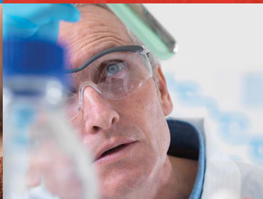
Proficiency Testing Programs