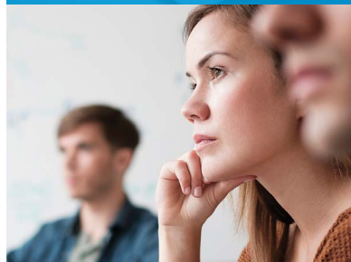
Training and E-Learning