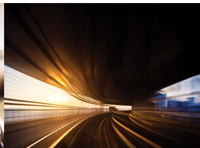
Integrated Technology Services