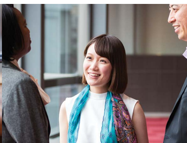
Standards Development and Membership